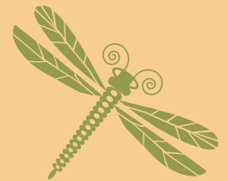
South Beach Chamber Ensemble at the Miami Beach Botanical Garden