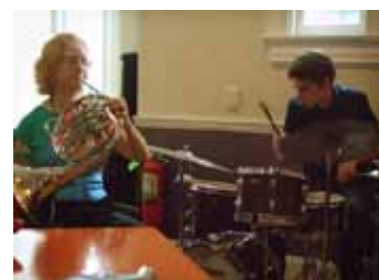
Performances at the Vortex Live CD release party

If you haven't been to a Vortex concert, you can hear all about it by getting your own CD from CDBaby ( http://www.cdbaby.com/cd/vortexseries ) or Spindrift ( www.spindrift.com/vortexcd ).